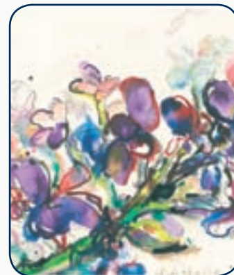
Artworks - mixing technique - by Gerlinde Gschwendtner

All kinds of watercolour and acrylic paper, drawing board and primed canvas are suitable surfaces for watercolour painting with AERO COLOR® Professional . When using mixing techniques together with HORADAM AQUARELL® canvas need to be pre-primed with an absorbent primer/base coat (e.g. structuring paste, 50 543).